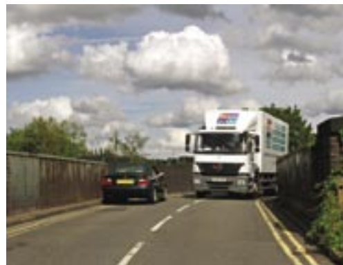
HGV alternative route management.

The hierarchical approach to the network is likely to expand over the next few years to take more account of vehicle flows, importance in linking communities, school routes, bus routes, employment corridors, access to hospitals, shops and leisure.