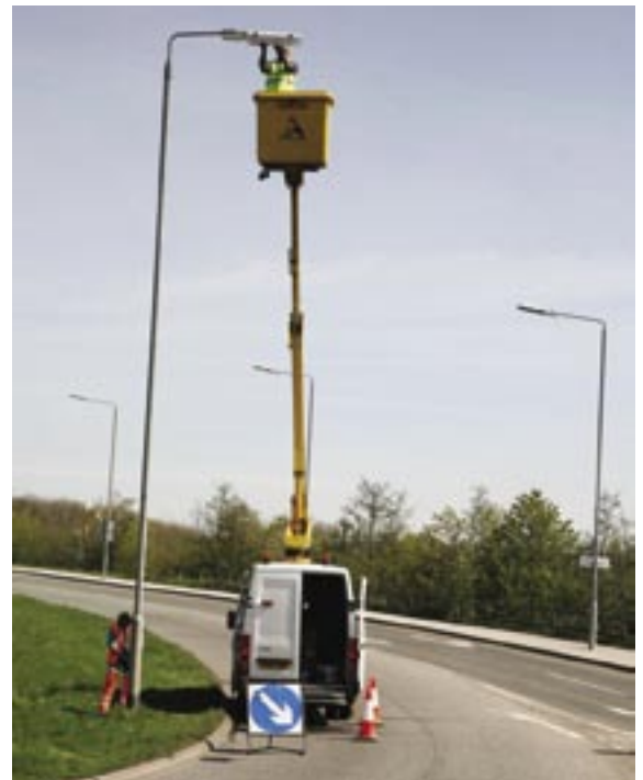
Street lighting maintenance.

As previously described in section 6.1, the Environmental Services Department has implemented an EMS to achieve continual improvement in environmental performance.