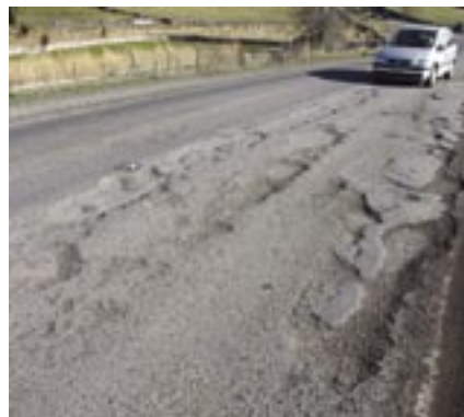
Brierlow Bar carriageway repairs. Before.

In the last two years, we have captured better information about all of the highways assets and have integrated these into the systems used to manage the highways. The information is now accessible to all staff at their desktop and in a mapped form, providing everyone involved in managing the network with a complete understanding of the needs and effects of intervention