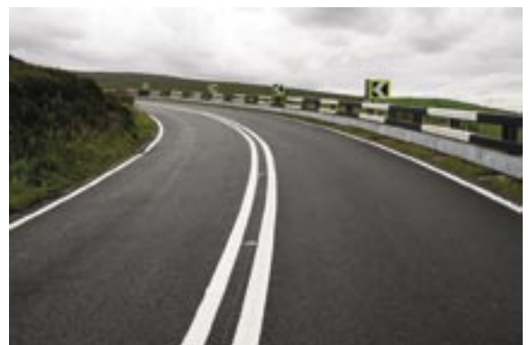
High visibility lining on the A57.

Drains - integrate drainage into the models being developed to manage flood water.