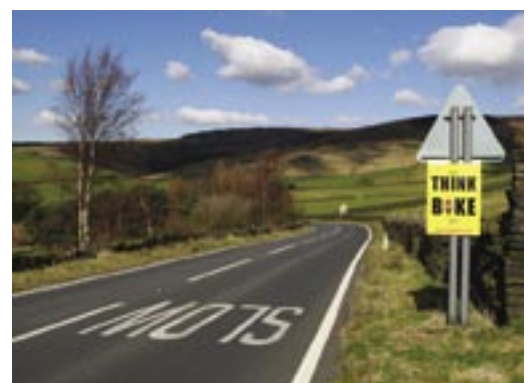
A57 at Glossop.

The council will continue to capture and make use of condition surveys in managing the network. Highways, and in particular roads, benefit from an annual survey based on national criteria, which provides both invaluable information for maintaining the network as well as providing information with which to benchmark the County’s performance regarding monitoring expenditure versus performance/satisfaction. Over the next few years, the knowledge developed regarding other highways assets will enable the entire network to be more effectively managed. Early pilots are in hand to develop better management of road gullies to provide data-targeted interventions based on knowledge on frequency of silting. The future emphasis will be on using life cycles, condition surveys and better data.