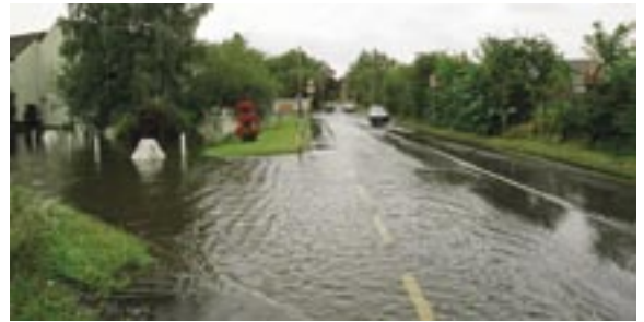
Flooding at Willington.

The Flood and Water Management Act (2010) places a new requirement on the Council to take responsibility for managing flooding arising from surface water throughout the County. European regulations require that the Council prepares flood risk assessments. The Council has started this work, which will be updated every six years. The aim of the Act and regulations is to enable a better management of surface water across the County, but particularly where it has an effect on people's daily lives or places people at risk. Over the next few years, the Council will work with the planning authorities to develop more sustainable means of disposing of surface water for new developments, and will develop a register of assets that are either beneficial or detrimental to the management of surface water so that these assets can be better monitored and controlled.