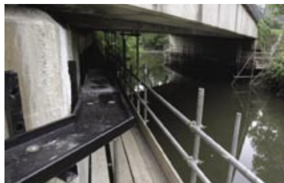
Otter ledges to reduce wildlife road casualties.

One of the benefits of the move to a more GIS (Geographic Information Systems) orientated management system for the transport network is the additional information that can be viewed at the desktop. Highways maintenance and improvements often take place in areas where certain habitats are protected (e.g. European Special Areas of Conservation and Special Protection Areas), and there are many locally important habitats and species that would benefit from similar protection (e.g. linked with Local Biodiversity Action Plans). There may also be opportunities to