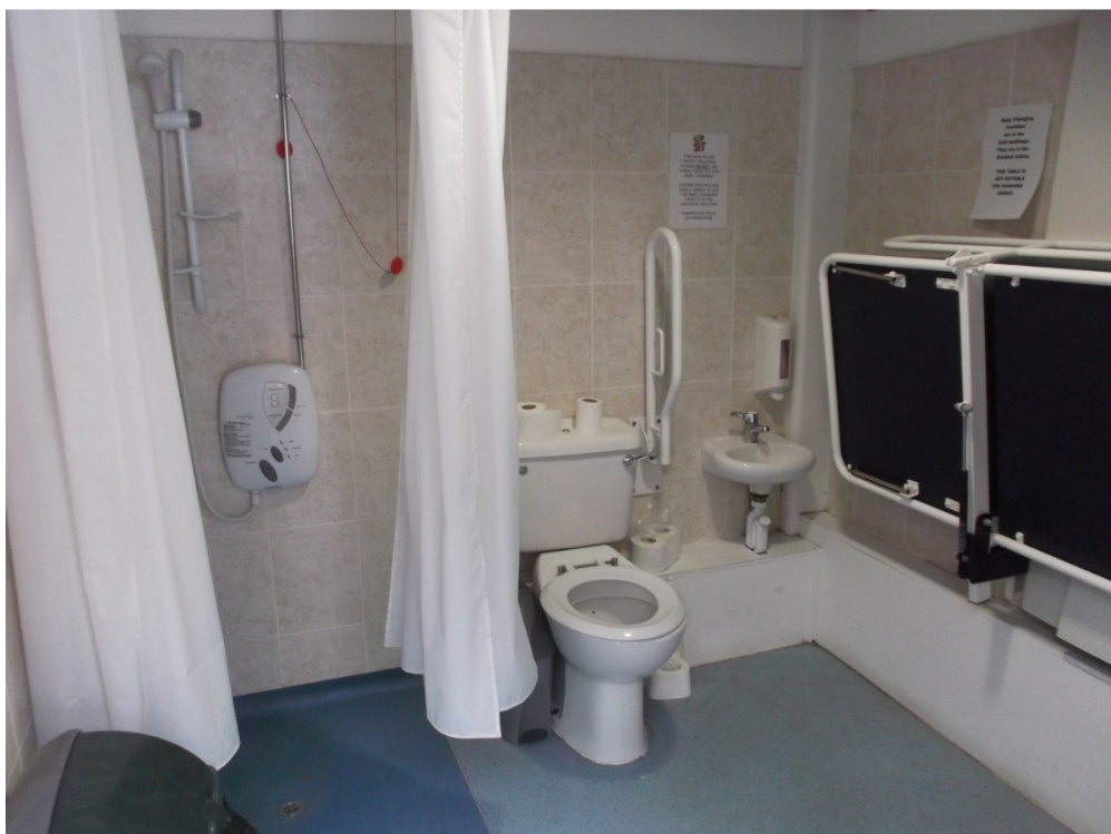
Access to the toilet with the couch folded away