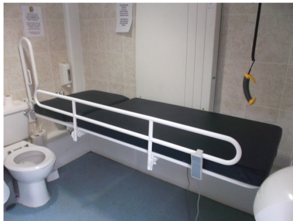
The couch when folded out