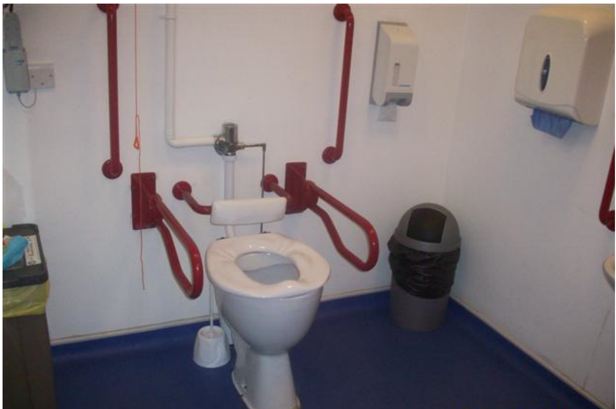
Separate accessible toilet