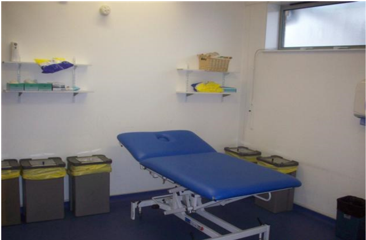
Room 2 layout