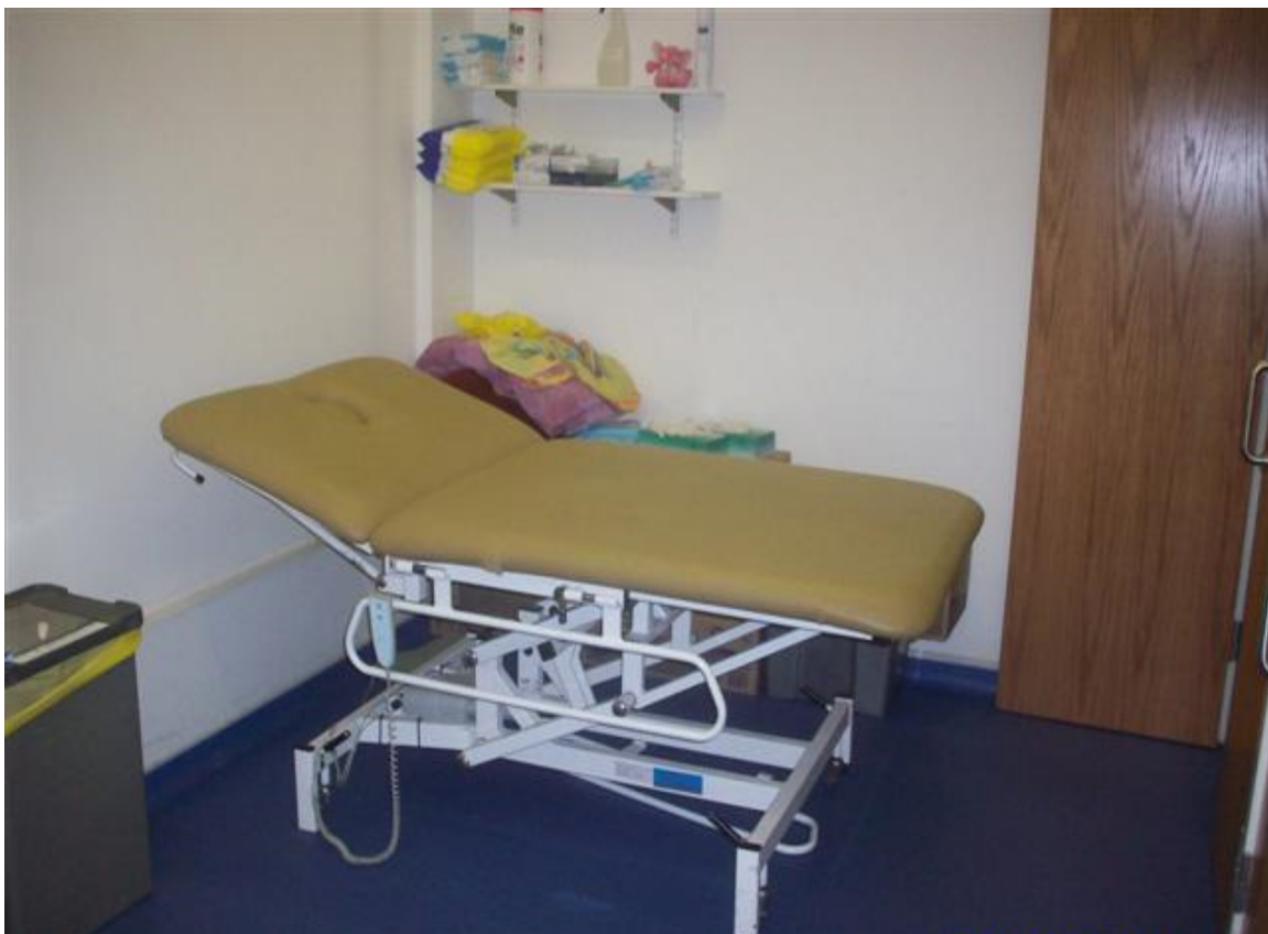
Room 1 lay out