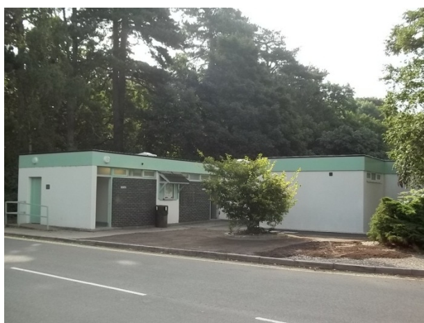
The toilet block – entrance to the main car park