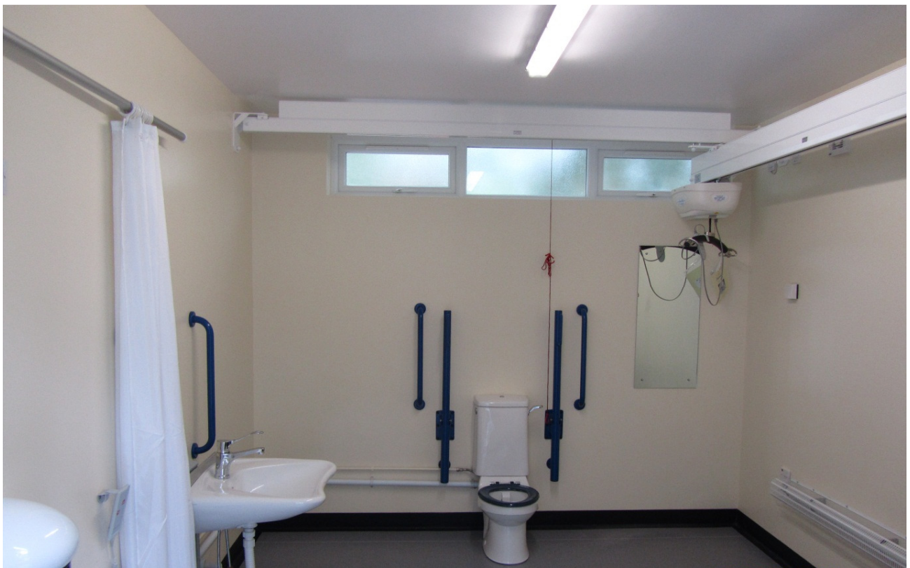
Inside the Changing Places