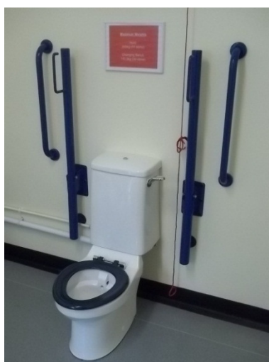
The toilet with space either side