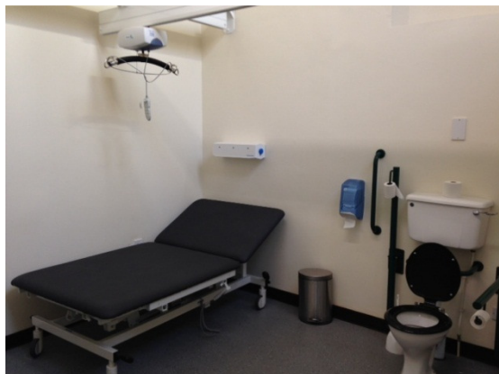
The room layout