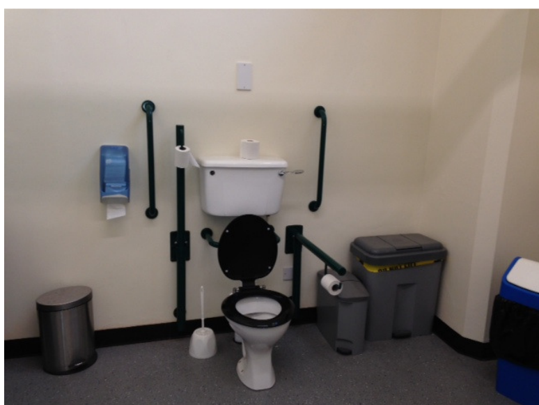
The toilet with space either side for assistance