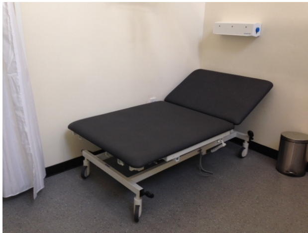
The changing couch