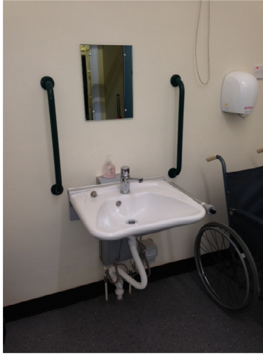
Adjustable height wash hand basin

For more information about this facility, please contact County Hall (see next page for details).