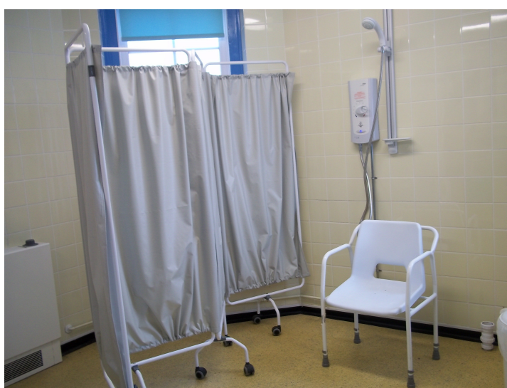
Screen for privacy / shower and shower chair