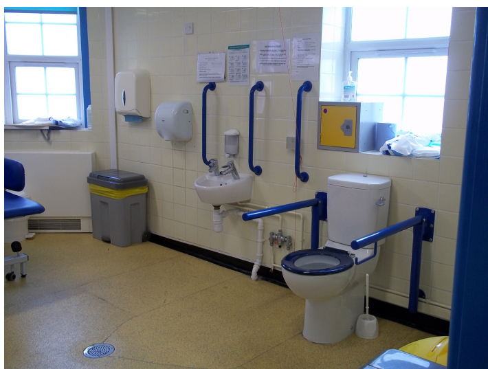
Toilet with space for assistance