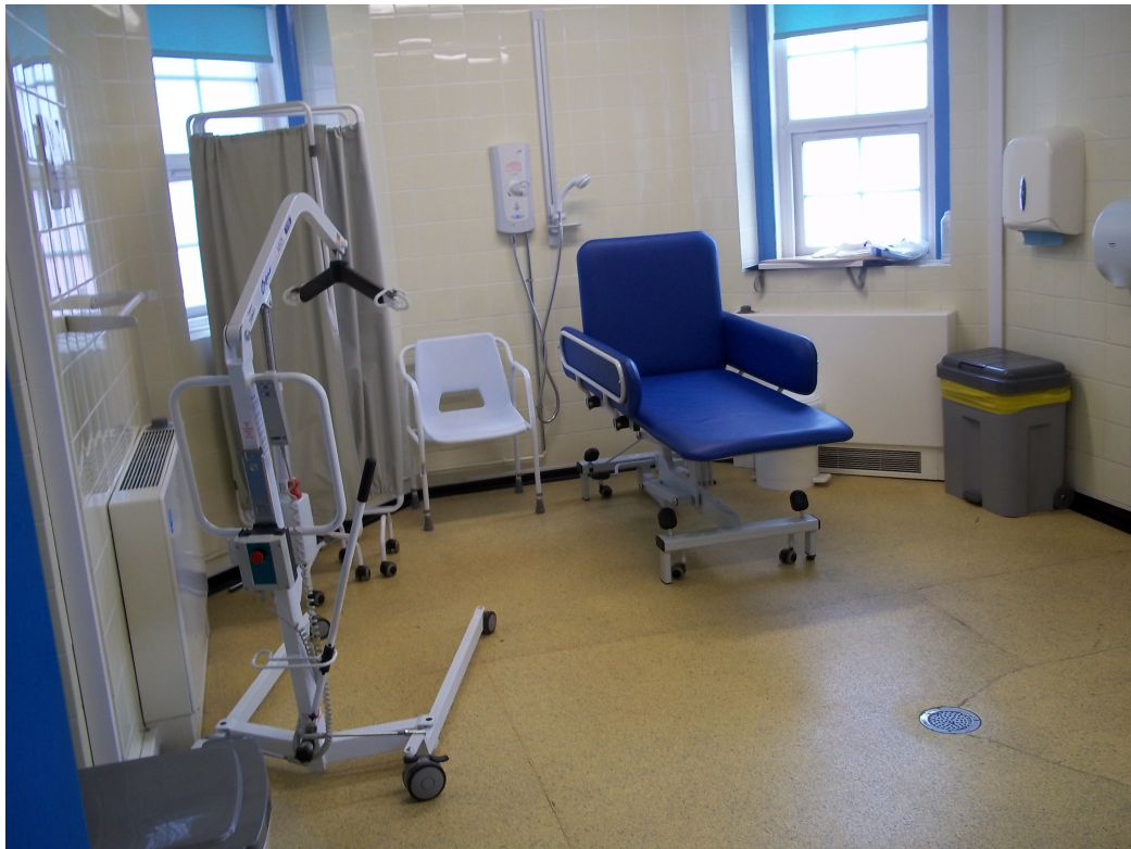
Spacious area with plenty of room for manoeuvrability and changing couch,