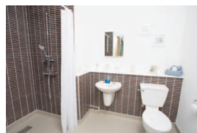
Photographs of the Smithybrook View show flat