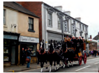
Tantivy during Discovery Days