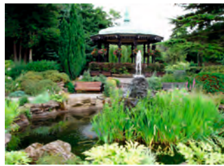
Belper River Gardens