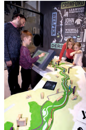
In Cromford's Visitor Centre