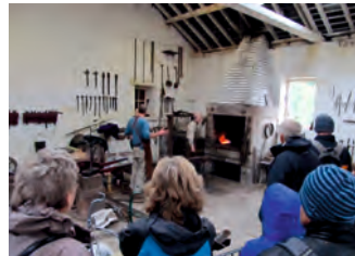
High Peak Junction interior