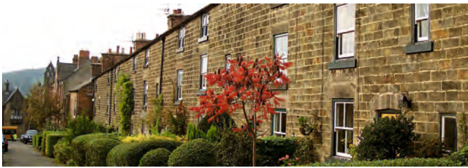
Long Row, Belper