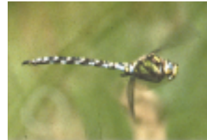
Southern Hawker Aeshna Cyanea

Located within the old colliery yard to the east of the River Doe Lea is an area of derelict land commonly known as Snipe Bog. This area contains two small ponds, reedbed and carboniferous limestone embankments colonised by rare calcareous plant species. With ecological advice from Derbyshire Wildlife Trust, Groundwork Creswell have improved access to this area whilst maintaining these diverse habitats.