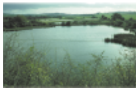
Carr Vale Flash Nature Reserve