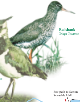
Redshank Tringa Totanus