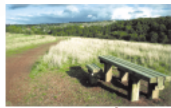
Peter Fidler Reserve Former Bolsover South Tip