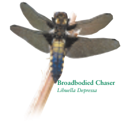
Broadbodied Chaser Libellula Depressa

This Derbyshire Wildlife Trust Reserve originally formed by mining subsidence has recently been extended by the Changing Places Project. The new wetland habitat areas include open water, shingle banks and reedswamp surrounded by meadow and scrub. These habitats attract a variety of wildlife. In spring, plovers and several species of duck come to breed. In winter, large flocks of Lapwing, Golden plover and gulls use the site. The meadow areas are also popular with butterflies and the pools attract dragonflies such as Black Tailed Skimmers and Broadbodied Chaser. Walkers access only from Stockley Trail and Peter Fidler Reserve.