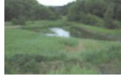
This is the new reed bed created at A

In the summer Dragonflies are on the wing in the Peter Fidler Reserve. Watch over the new pools for these fascinating insects. You will see Emperor, Brown Hawker, Common Darter