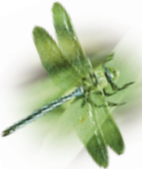
Emperor Dragonfly Anax Imperator