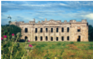
Sutton Scarsdale Hall