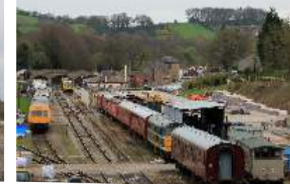
From left: view from Black Rocks across Cromford, Middle Peak Quarry, Ecclesbourne Valley Railway at Wirksworth

At the top of the steps, take the path that follows the fence line leading off to the right. The path heads upwards, eventually leading to the trig point at the summit of Barrel Edge.