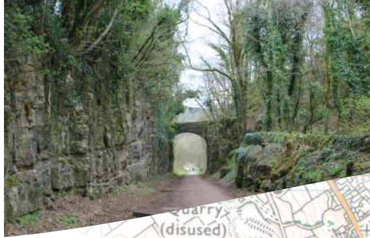
Pictured from left: view down the High Peak Trail, Middle Peak Quarry and Carsington Water Reservoir, pit for the cable return wheel at the foot of the incline.