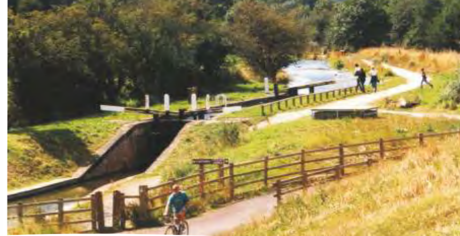
Photographs on this page. Above from left: Holmebrook Valley Park, Bluebank Lock on the Chesterfield Canal. Bottom from left: Linacre Reservoirs, cycling on one of the many routes in the area, horse riding is a popular activity, the latest addition to the Chesterfield Canal is Staveley Town Basin.

Greenways are traffic-free routes that connect our towns and villages to the countryside. Walkers, cyclists, horse riders and disabled users can all explore the footpaths, cycle routes and bridleways that link the historic market town of Chesterfield to this area's beautiful countryside. Derbyshire County Council is always looking for opportunities to link, extend and improve the Greenways network to make it easier for you to get from home to work or out to enjoy the countryside. Using our Greenways you can leave the car at home, hop on a bus and forget about parking.