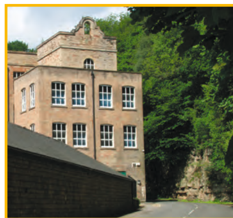
Pleasley Vale Mills

Prehistoric man occupied caves at Creswell Crags. Archaeological evidence indicates it be the most northerly site used during the last Ice Age, making it internationally important. Modern man harnessed the area's watercourses for industry and, at Pleasley Vale, has constructed large textile mills using the local limestone. These survive today as industrial relics, largely disused and are imposing features within this narrow gorge. Many are now undergoing redevelopment for alternative uses.