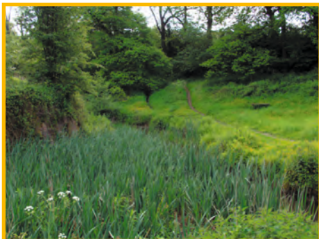
Wetland habitat at Pleasley Vale