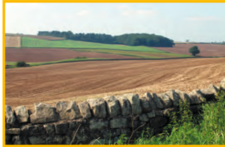
Occasional dry-stone walls

and are a feature around rural villages, such as Whitwell, Elmton and Rowthorne. Hedges in these areas tend to be bushier and more species-rich than those found elsewhere. Dry-stone walls also feature in places, more notably around the villages and along lanes.