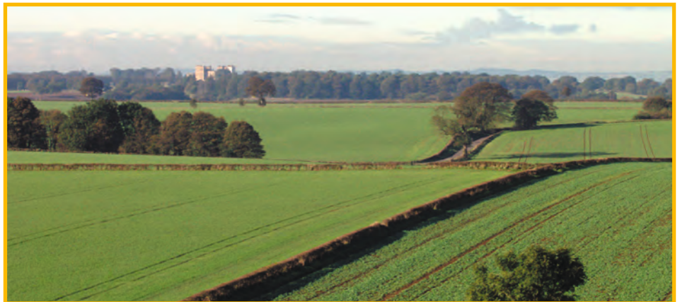
Hardwick Hall and park set within the Limestone Farmlands

Wealthy landowners have had a notable influence on the area by developing estates centred on great houses set in parkland. The best surviving example is Hardwick Hall. The park at Hardwick has escaped the intensive arable farming common over much of the Limestone Farmlands and preserves historic landscape features absent elsewhere.