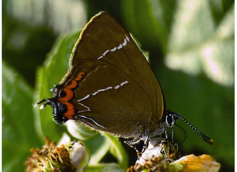
Right: White-letter hairstreak butterfly. Below: Living bird table in school grounds.

White-letter hairstreak Satyrion w-album Green hairstreak Callophrys rubi