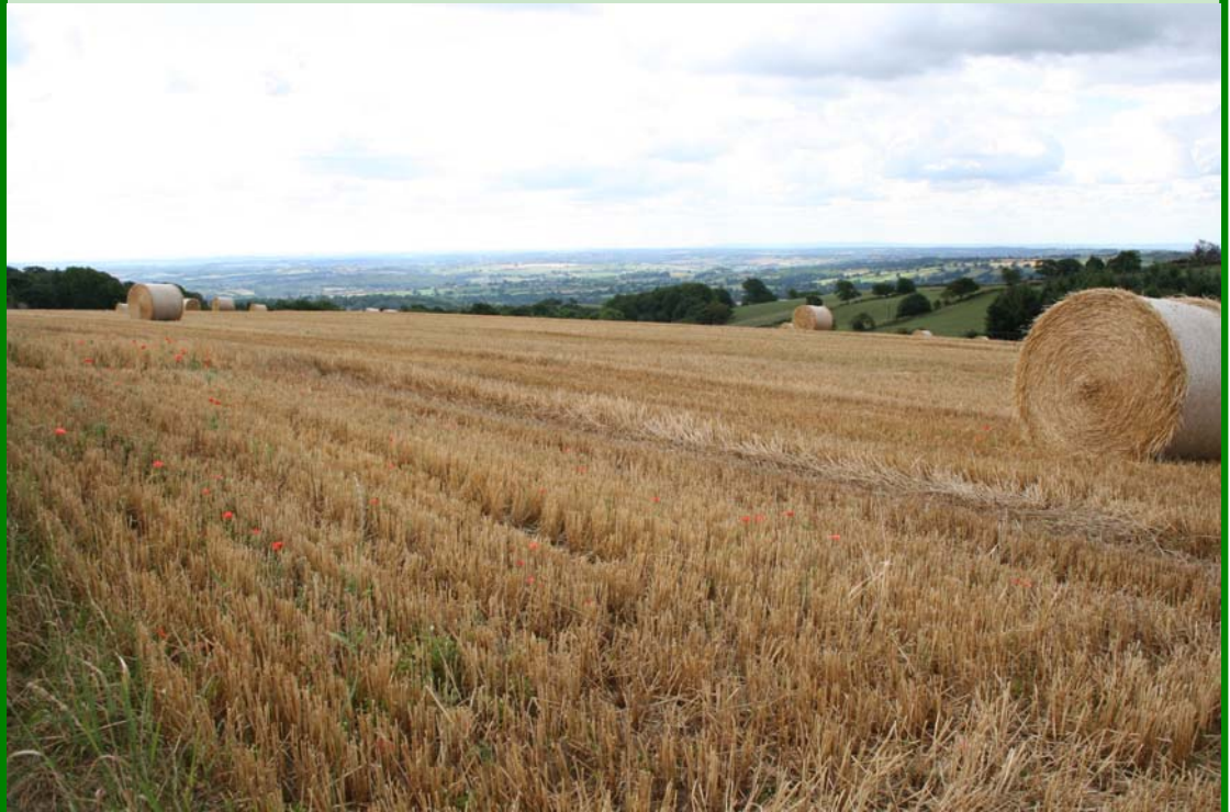
Arable field with scattered poppies.

Prepared by the Lowland Derbyshire Biodiversity Partnership