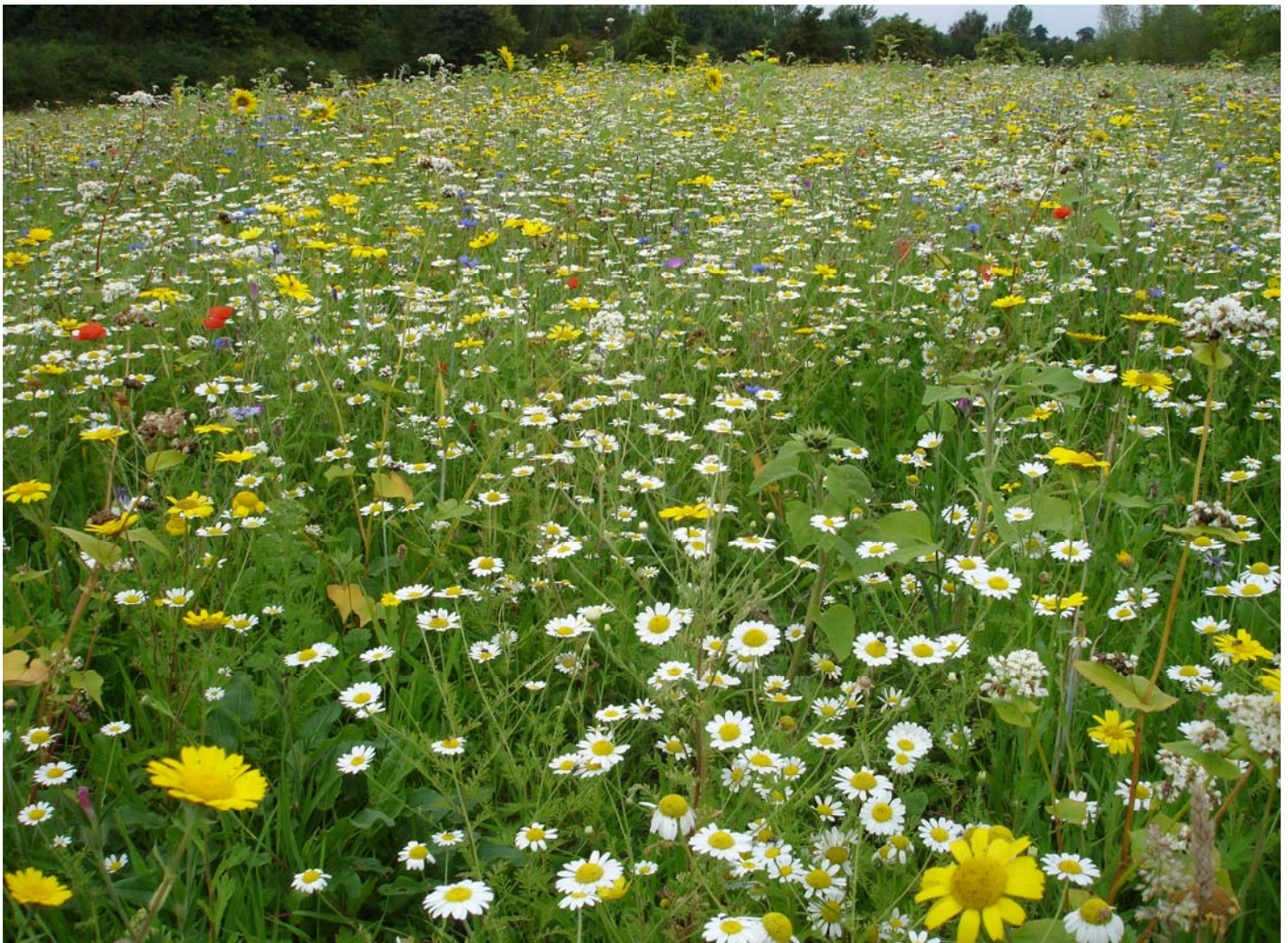
Living bird table.

Note: Derby is omitted from this list because it is not, in itself, a Character Area. The administrative boundary of the city of Derby actually straddles four such Character Areas: the Needwood and South Derbyshire Claylands, the Trent Valley Washlands, the Derbyshire Peak Fringe and Lower Derwent, plus the Notts, Derbyshire and Yorkshire Coalfield.