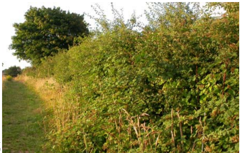
Hedgerow and hedgerow tree.

This Action Area is an important agricultural region in Derbyshire. It is one of the remaining strongholds for farmland birds, though recent changes in agricultural policy have resulted in more intensive farming which reduces habitat availability for these species. Uptake in the field margin options of entry-level stewardship schemes could be increased by more targeted advice being available.