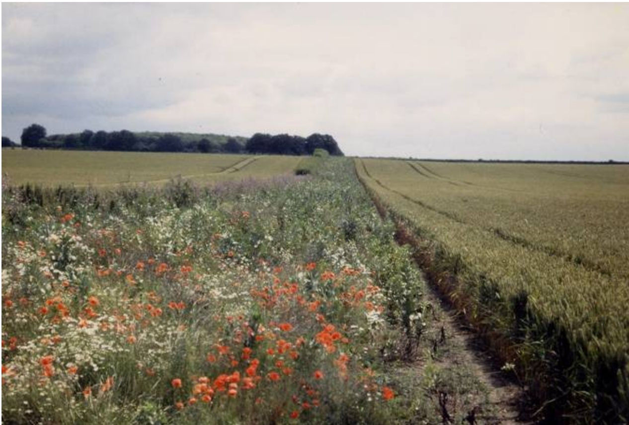
Field margin.

Appendix 1 and 2 lists Priority Species as well as a range of locally important and local Red Data Book species found in farmland habitats.