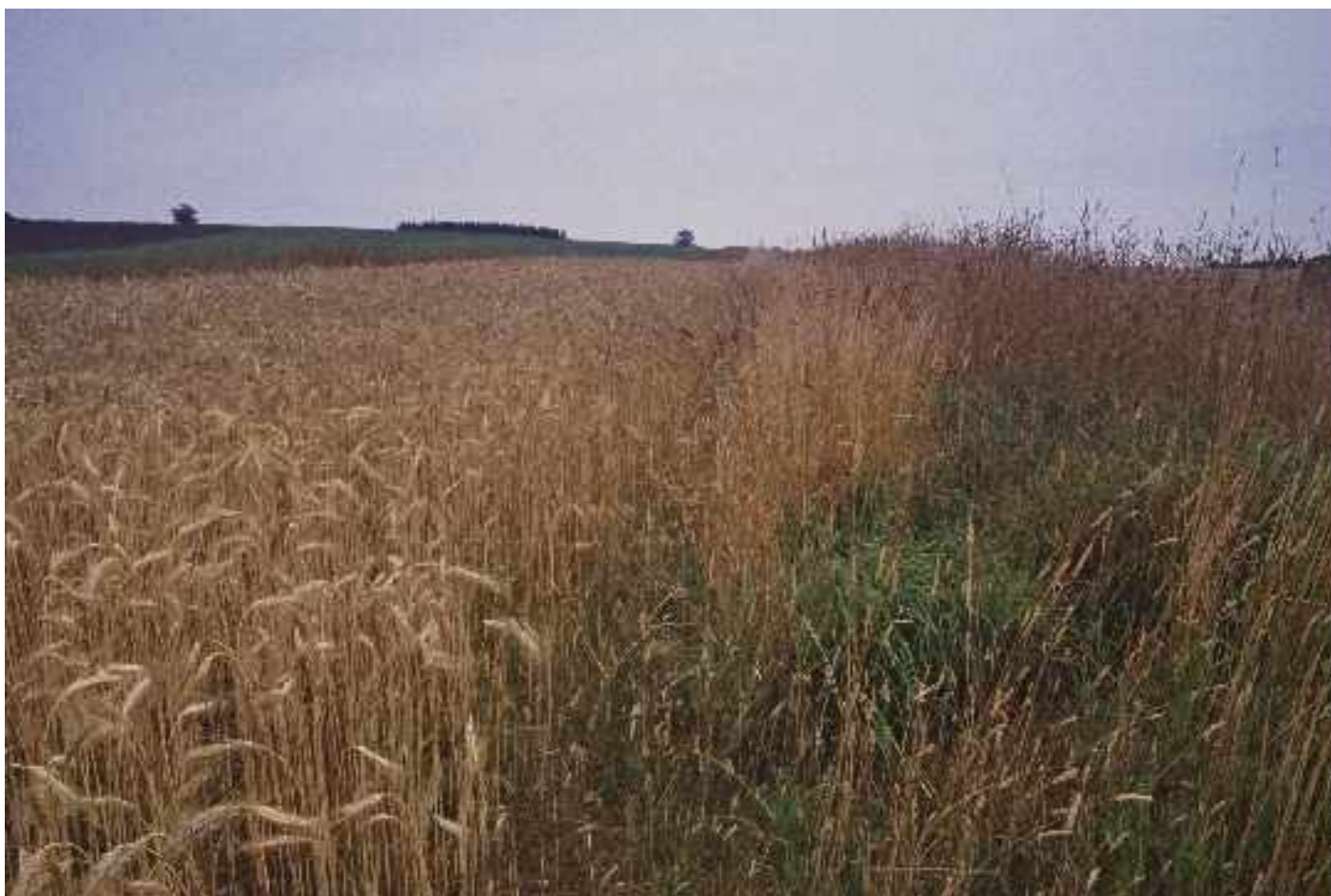
Beetle Bank.

It is difficult to comment authoritatively on the distribution of field margins in Lowland Derbyshire as no audit has ever been carried out. It can be said, however, that there is more likely to be a greater amount of arable field margins within the Magnesian Limestone, Rother and Doe Lea Valleys, and National Forest areas as they are the main arable areas of Derbyshire.