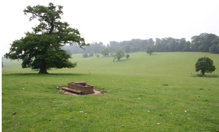
Parkland at Kedleston.

Note: The terms Primary, Secondary or Localised feature used above are synonymous with 'Primary Habitat' etc. used in the Landscape Character of Derbyshire (2003) see www.derbyshire.gov.uk/landscape . These describe how noticeable and distinctive each habitat is within the landscape itself. Only Primary Features are shown in the detailed map of each Action Area in the Maps section.