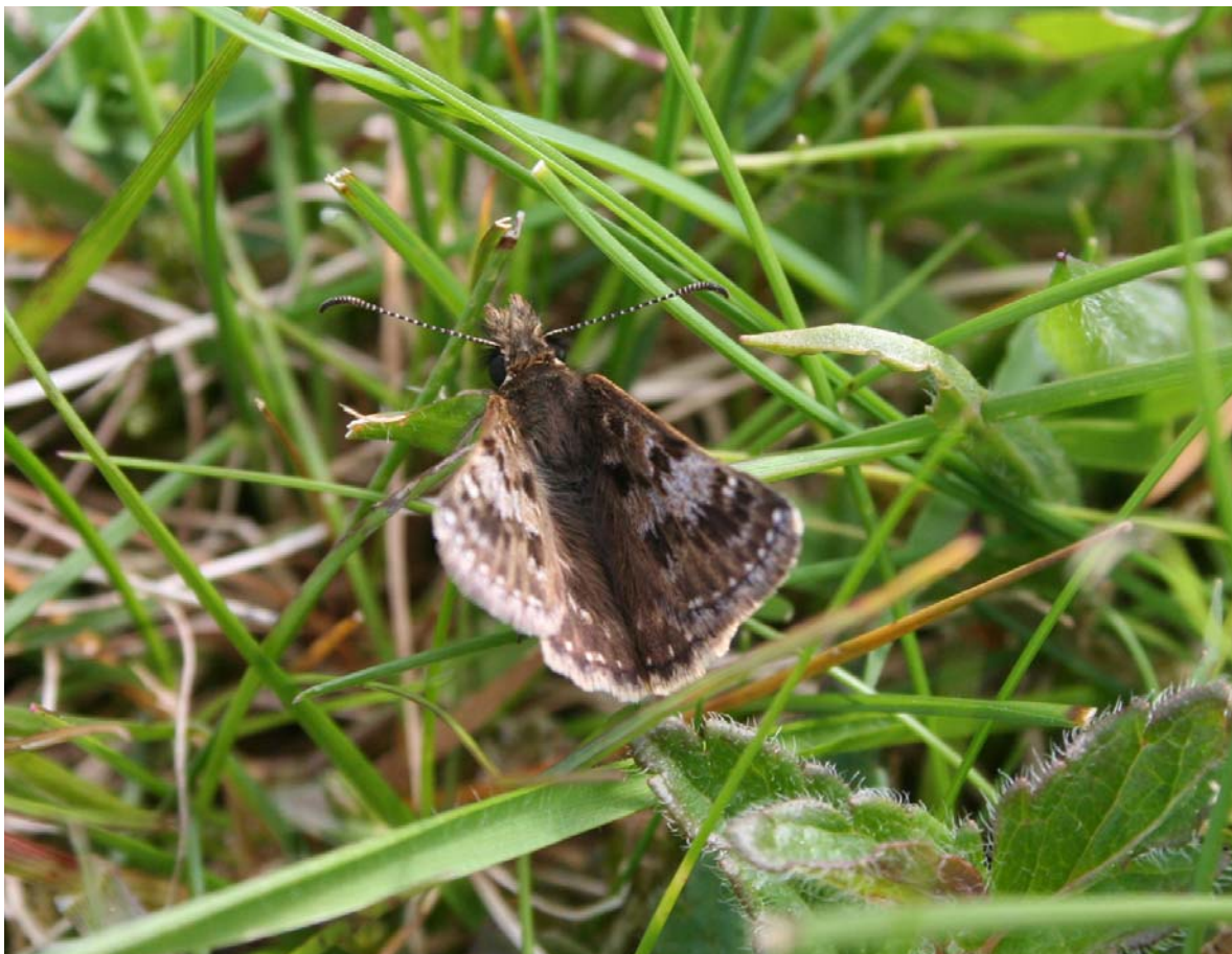
Dingy Skipper

White-clawed crayfish are a key species within this area, but have only been recorded at three grid squares (3 x 1 km 2 ) since 2000. These are at isolated sites, such as Kedleston Hall and Shirley lakes. Target: Increase range by the creation of an additional ark site.