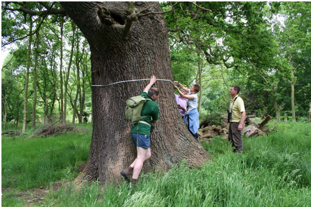
Recording Veteran Trees at Kedleston Park.

* indicates Lowland Derbyshire Biodiversity Partnership member. If your group would like to join the Partnership, go to www.derbyshirebiodiversity.org.uk