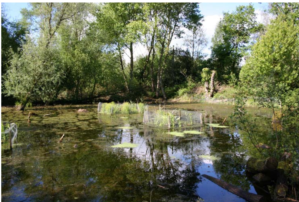
Reedbed planting at Hilton Gravel Pits SSSI