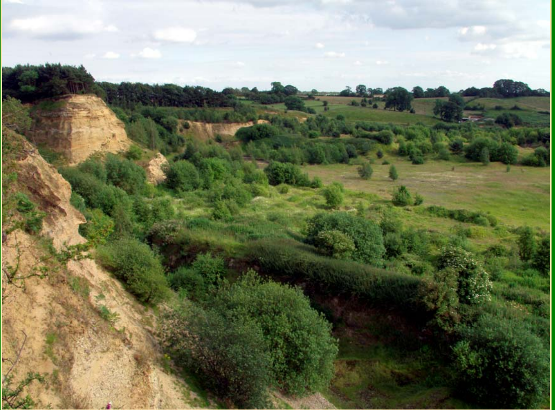
Sand quarries of the Sandstone Slopes and Heaths near Muggington.

Prepared by the Lowland Derbyshire Biodiversity Partnership