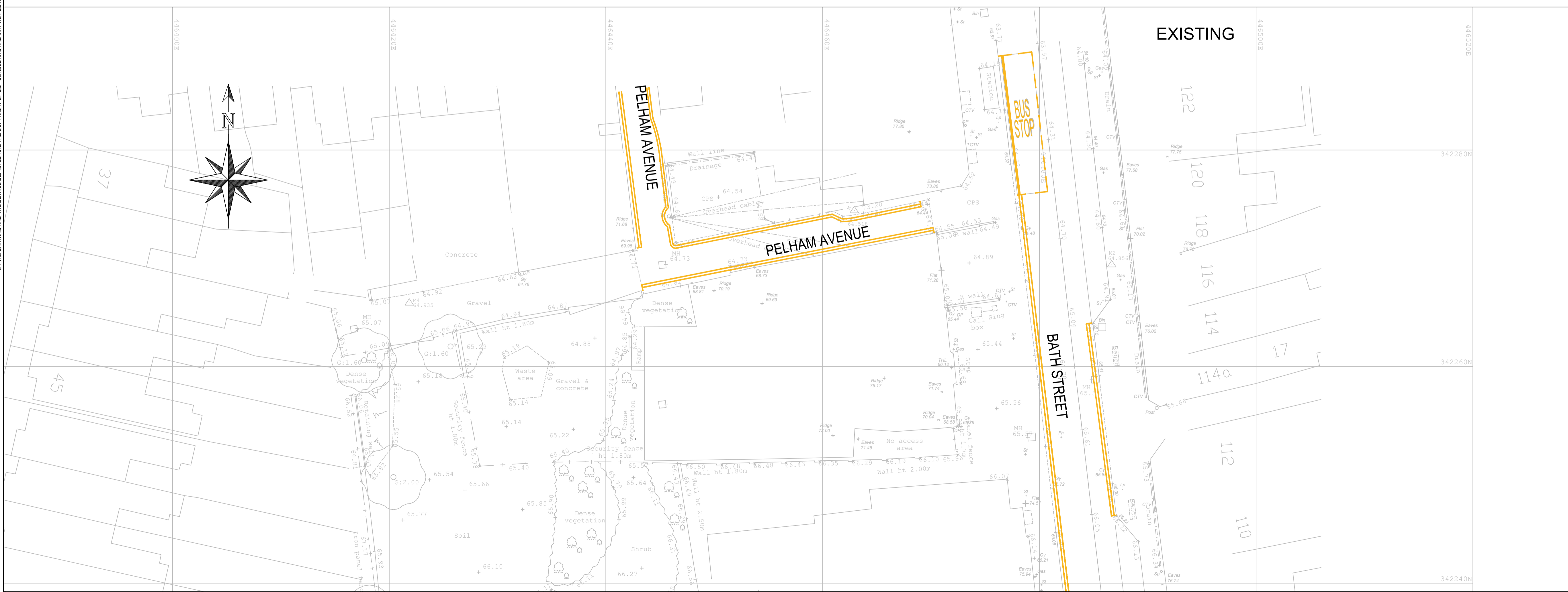
EXISTING YELLOW LINE PLAN Scale 1:200