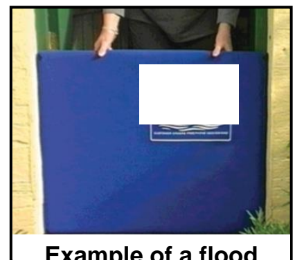
Example of a flood defence product